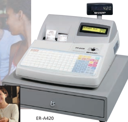
ER-A420 Flat Keyboard